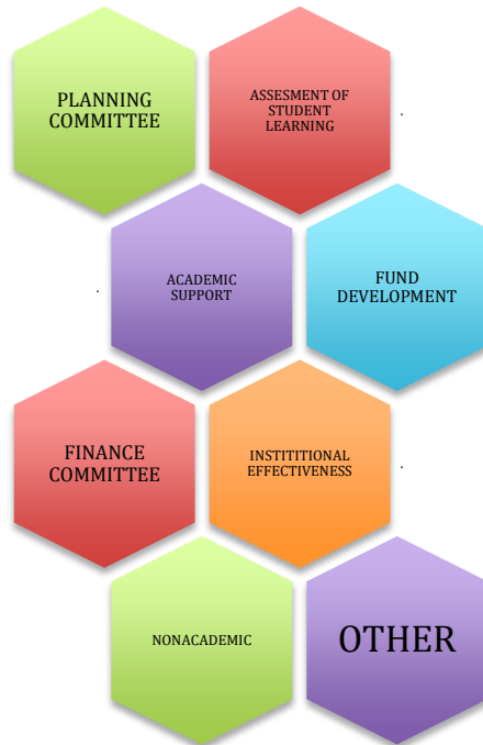
FIGURE 3. Integration.