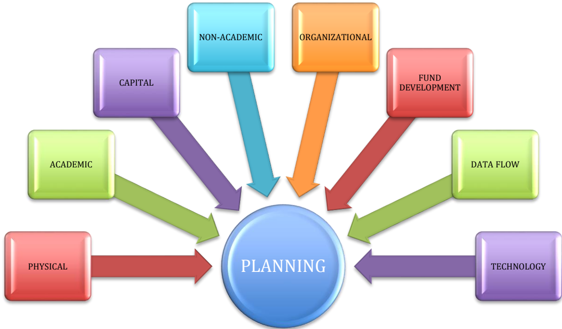
FIGURE 2. Components of the planning