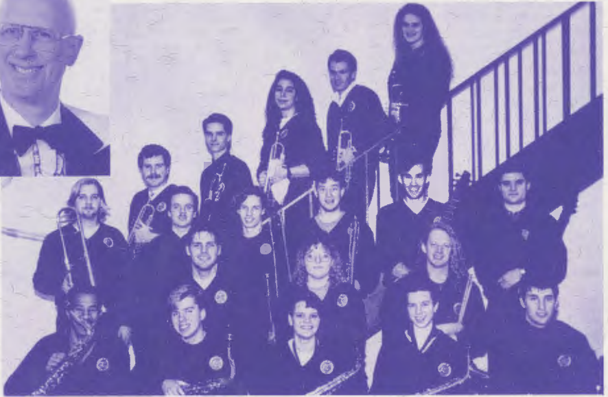
Jazz I to back Clark Terry and Louie Bellson